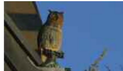
Placing a figure of an owl on your roof is thought to deter pigeons. But pigeons know a real owl when they see it and tend to just perch on top. This one spotted in Parkgate