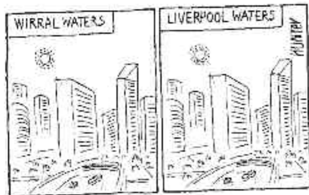
SPOT THE DIFFERENCE

Some people are ecstatic over these proposed monoliths. Artists' impressions look like sets for a sci-fi movie. As no people are ever pictured, we need more explanation on how people will live there - shops, schools, parks etc