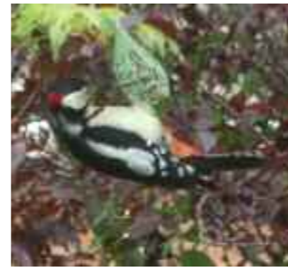
Many birds are drawn to our back gardens by fat-balls and seeds. Photo of a greater spotted woodpecker

Two swans sliding on a frozen golf course pond: a jay landing on the Wirral Way: A chaffinch in a thorn bush: A bird of prey swooping silently through the sunset woods: Talkative sparrows jostling on a fat ball: Six white ducks clamouring to be fed on Raby Mere: A pheasant running down a country lane.....and