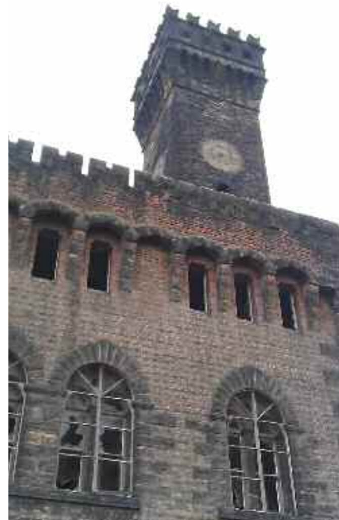
The former Hydraulic Tower at Tower Road. Listed Building Consent was granted on 18th June 2009. Peel has 7 years to run before the permission lapses