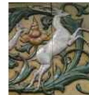
Della Robbia plaque detail, Birkenhead Central Library