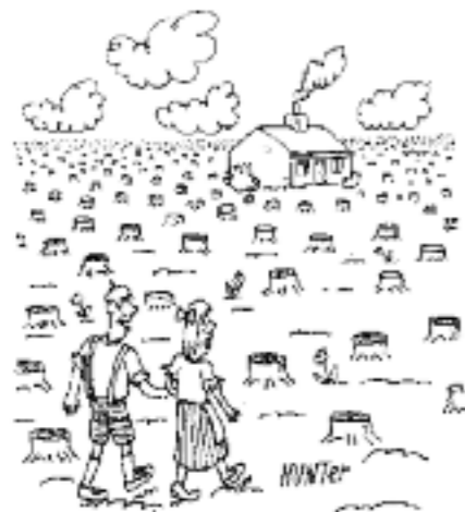
'Oh look, a woodcutter's cottage' a HUNTER cartoon

Proposed Golf Resort, Hoylake: We are concerned that if the construction of this project goes ahead it will, amongst other things, severely affect established wild-life, whilst not bringing the anticipated economic benefits.