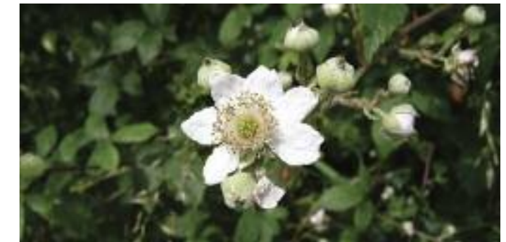
The bramble flower promises autumn blackberries

A less obvious place to flower-spot is Bebington Station, a more pleasant occupation than counting the litter there. While waiting for a train to Chester I counted wild poppies, purple tufted vetch, groundsel, bramble, speedwell, birds foot trefoil, marestail, ragwort, hop trefoil, scarlet pimpernel, greater and lesser willowherbs, hogweed, lucerne.