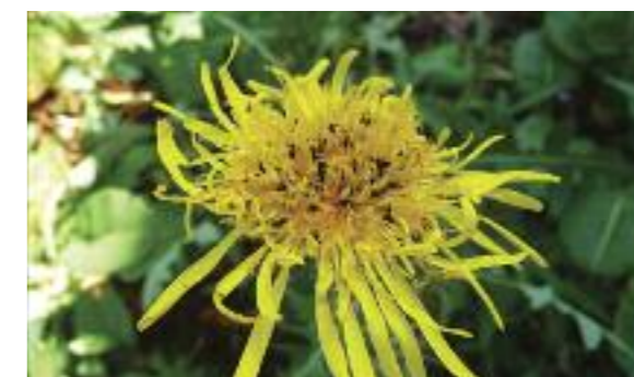
A wildlife zoo on the sow thistle

Editor's note: The hot, dry weather in June and July have brought a more promising sight to the walkers of Wirral's non agricultural countryside. Butterflies have abounded among wild flowers and grasses on the dunes at Gunsite, Leasowe, the cliffs at Caldy and on the old seawall at Gayton at the bottom of Riverbank Road. Many grasshoppers were seen and heard there too. Along the Wirral Way butterflies danced among knapweed and St. John's Wort and often rested dangerously, for them, on the main path.