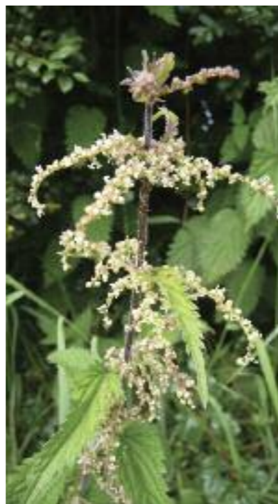
Stinging Nettle, a valuable resource for over 40 varieties of insect. Butterflies - small tortoiseshell, peacock and red admiral all lay their eggs here. See www.nettles.org.uk Forum.gardenweb.com