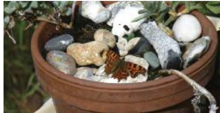
A comma butterfly sunning in early August