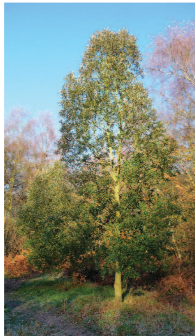
The Holm Oak, planted by the Woodland Trust and Friends of Storeton Woods in the Millennium is thriving. Both organisations have worked together since they bought the woodland in 1990