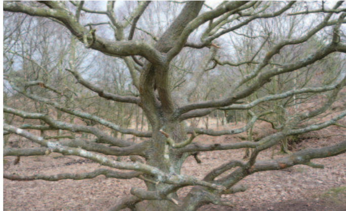
On Thurstaston Common